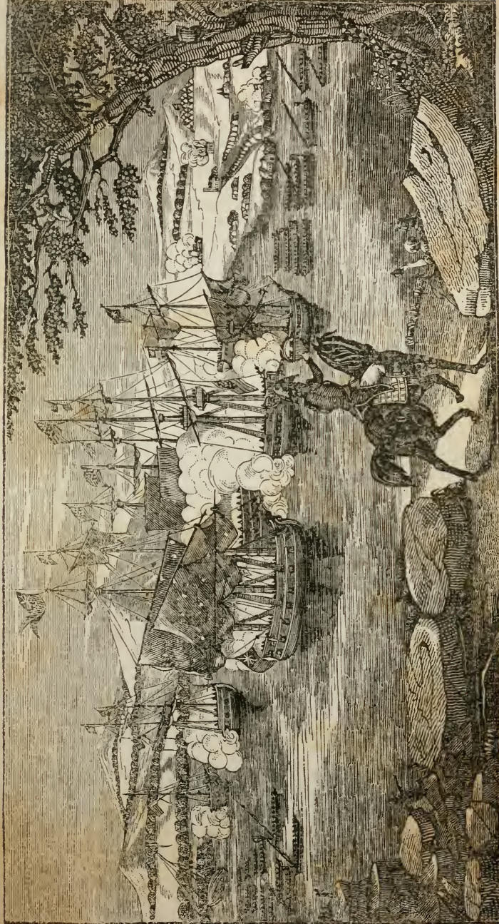
BATTLES OF LAKE CHAMPLAIN, AND PLATTSBURG . . . . COMMODORE M'DONOUGH, AND GENERAL MACOMB.